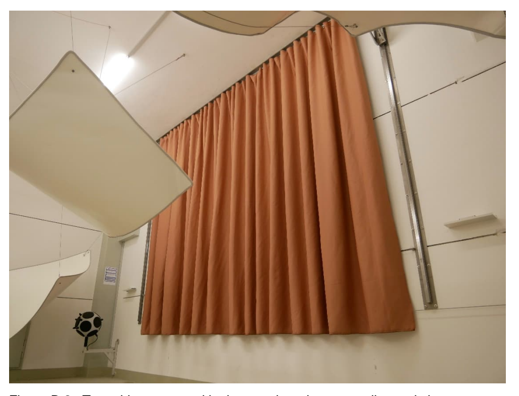
Figure B.2. Test object mounted in the reverberation room, diagonal view.